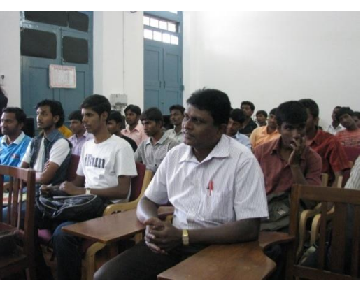
2012- Two-day Workshop on "Geoinformatics for Natural Resources Management", for Under Graduate Science Lecturers, at the Department of Geography (GIS), Maharaja's College, Mysore on 12th and 13th March 2012.