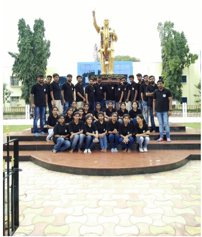
GIS Day 2018