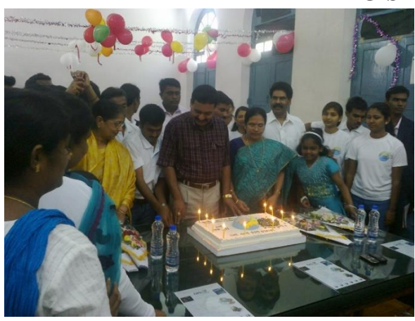
GIS Day 2012