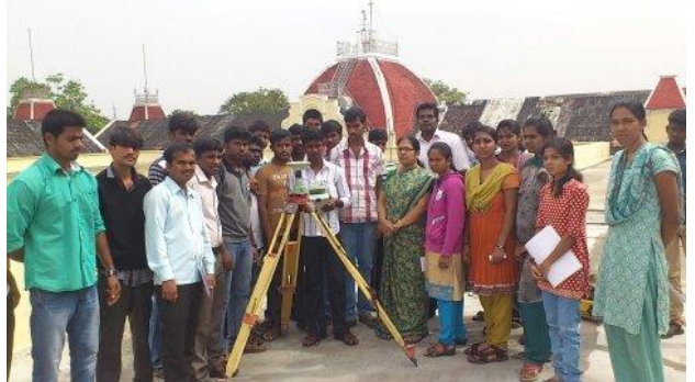
DGPS Survey for Mapping Applications by InfoMaps as a part of MoU

Organised 2-day Virtual International Webinar on "Geospatial Technology for Sustainable Development" – 05<sup>th</sup> to 06<sup>th</sup> February 2021, jointly organised by IGU and DOS in Geography, MGM