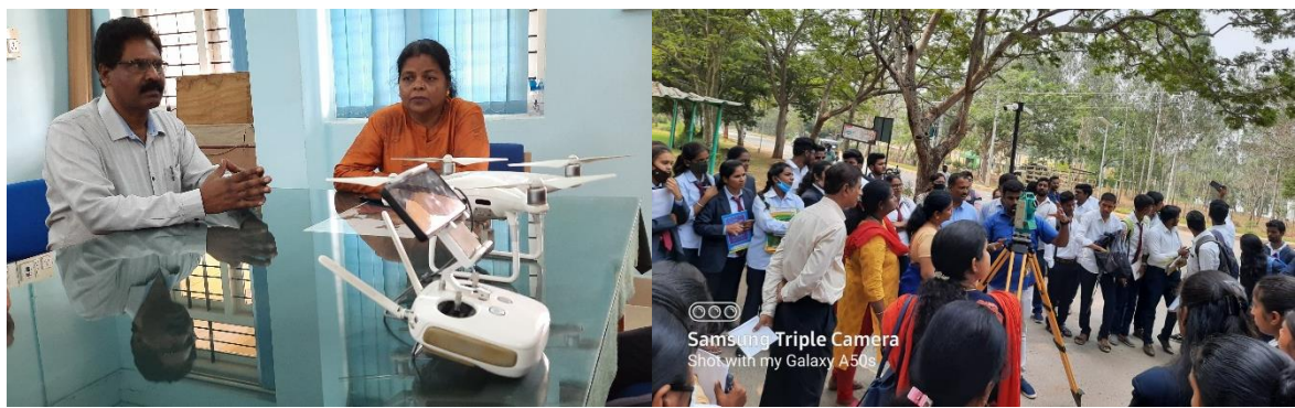
ACTIVITIES 5<sup>th</sup> Year Completion Celebration