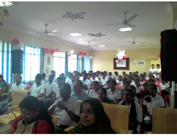
GIS Day 2016